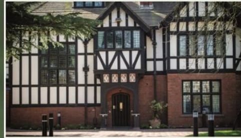
Hampton Grange & Gwen Walford